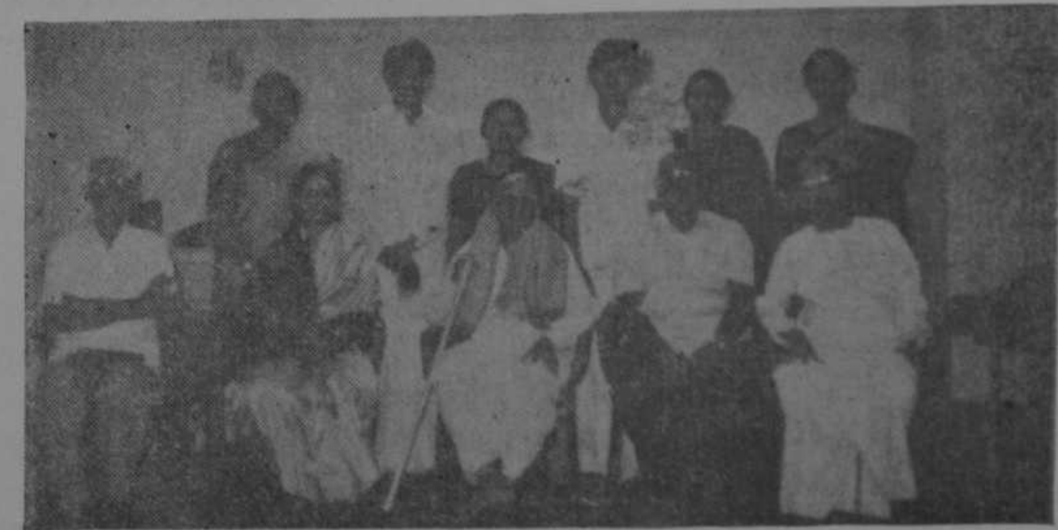
Advanced class students of the Shanmukhananda Sangeetha Vidyalaya with the Doyen Semmangudi Srinivasier at Narada Gana Sabha, Madras.